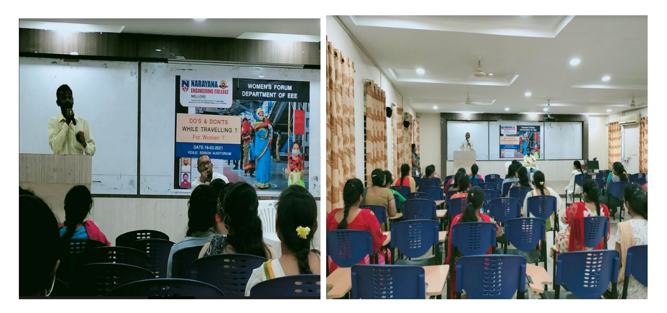
Students learning about Do's & Dont's While Travelling for women program