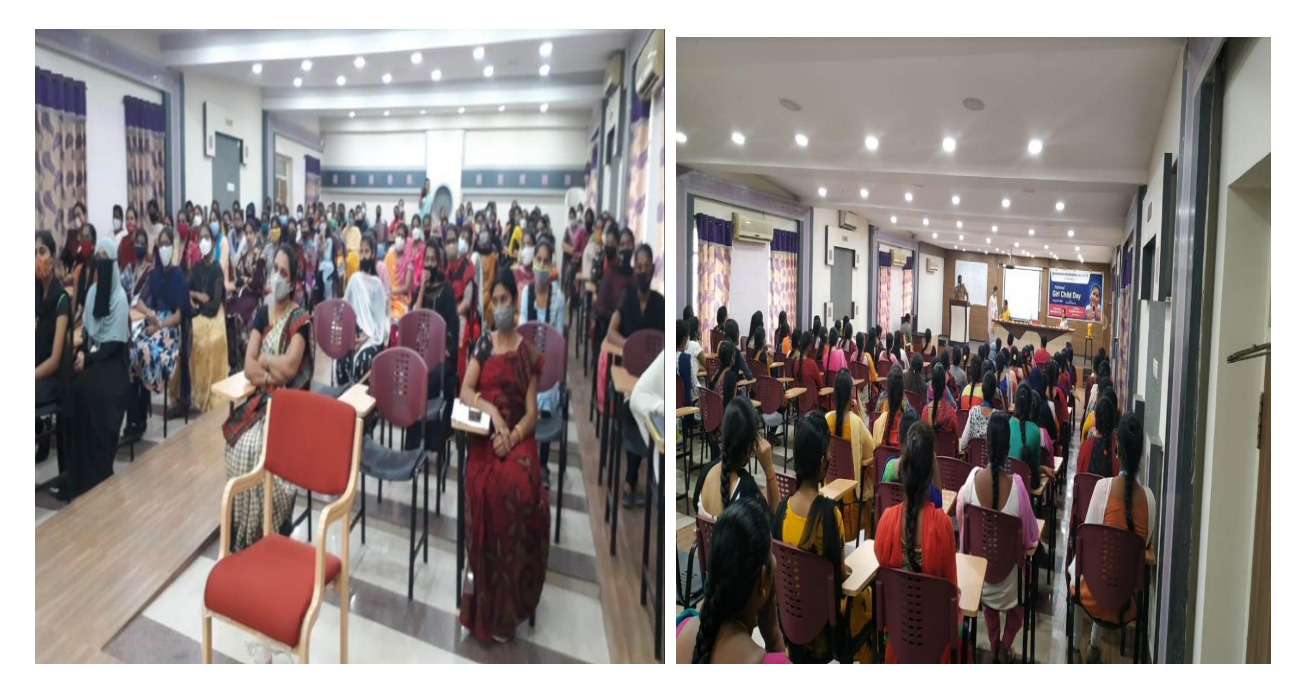
Students Listening the Resource person speech